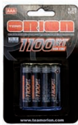
1100 HV NiMH AAA #ORI13201