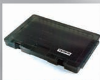
KYOSHO PARTS BOX #80463 L-410x264x43 #80464 M-232x122x32 #80465 S-120x83x25 #80466 SS-89x36x26