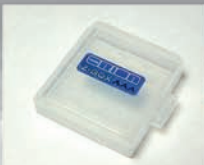
STORAGE CLEAR BOX (3) #ORI43020 AAA SIZE #ORI43021 AA SIZE