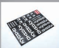
DECAL SHEET KYOSHO TEAM DRIVER #36275