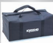
KYOSHO CARRYING BAG 320x560x220mm #87619 RED #87618 BLACK