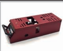
STARTER-BOX II KYOSHO #36209R RED LIMITED #36209 BLACK