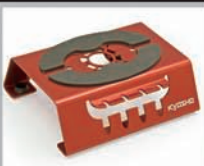
MAINTENANCE STAND LOW #36228R RED #362287BK BLACK