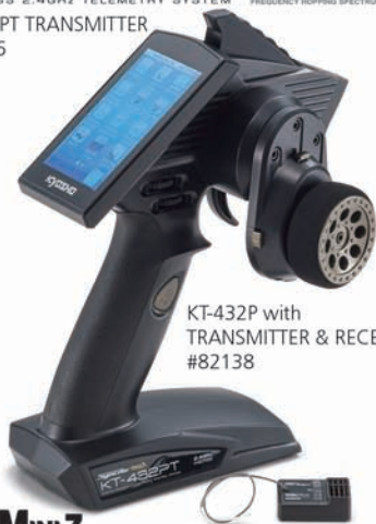
KT-432P with TRANSMITTER & RECEIVER #82138

Syncro touch KT-432PT FHS2.4GHz System FHS/FHS 2.4GHz TELEMETRY SYSTEM FREQUENCY HOPPING SPECTRUM SYSTEM KT-432PT TRANSMITTER #82136