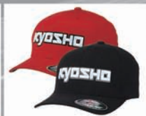
KYOSHO 3D CAP #30001BL L/XL-BLACK #30001BS S/M-BLACK #30001RL L/XL-RED #30001RS S/M-RED