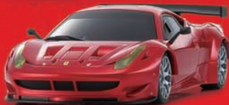
458 ITALIA GT2 #32206MR