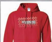
HOODIE K-FADE 2.0 RED KYOSHO 2016 (SIZE - S/M/L/XL/XXL) #88004