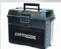
KYOSHO DELUXE BLACK PIT BOX #80460 542x300x397