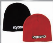
BEANY HAT KYOSHO #30002B BLACK #30002R RED