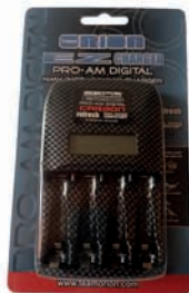
EZ CHARGER PRO-AM DIGITAL CARBON LOOK #ORI30402