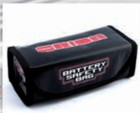
BATTERY SAFE BAG #ORI43033 20x9x7