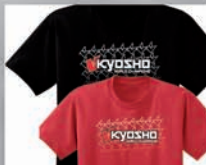
T-SHIRT K-FADE 2.0 KYOSHO (SIZE - S/M/L/XL/XXL) #88002 RED #88003 BLACK