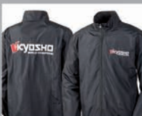
KYOSHO WINDBREAKER 2.0 BLACK 2016 (SIZE - S/M/L/XL/XXL) #88005