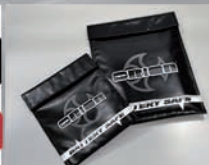
BATTERY SAFE BAG #ORI43023 23x30 #ORI43022 18x21