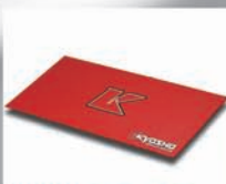
KYOSHO BIG K 2.0 PIT MAT - (61x122cm) #80823BK BLACK #80823R RED