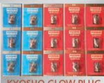
KYOSHO GLOW PLUG #74492 No3 #74491 No4 #74494 No5 #74495 No6 #74493 No7