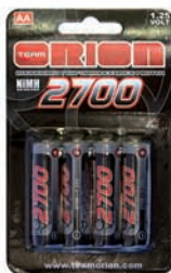
2700 HV AA #ORI13502