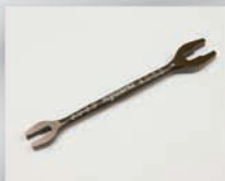
KRF TOOL 3.0-3.5MM. / 4.0-5.5MM. SPANNERS #36135