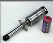
GLOW HEATER KYOSHO (ORION 2200) #362165