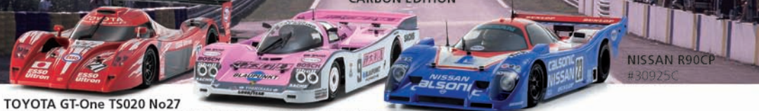
TOYOTA GT-One TS020 No.27 #309327C