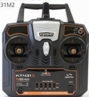
For aircraft, yachts, cars and DRONE RACER

Syncro KT-431S FHS2.4GHz System SYNCRO 4CH KT431S #82431M2