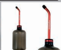
KYOSHO 500CC FUEL BOTTLE #96423 STANDARD #96424 SPECIAL