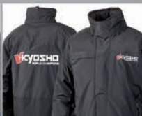
KYOSHO HEAVY JACKET 2.0 2016 BLACK (SIZE - S/M/L/XL/XXL) #88006