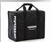
KYOSHO CARRYING BAG S/M/L-SIZE #87613 250x410x360 #87614 310x510x460 #87615 358x558x548