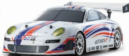
PORSCHE 911 GT3RSR #33203