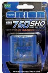
750 SHO Extreme Racing V-Max AAA #ORI13206