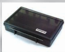
KYOSHO TOOL BOX #80462 330x230x65