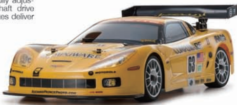
CORVETTE C6-R #33202

● Loaded with GXR15 engine with slide carburetor fitted with slow idle adjustment and return spring ● Reliable universal swing shafts included on front ● Turnbuckle tie-rods used for steering rod and rear upper arms for fully adjustable alignment ● KYOSHO's proven center-shaft drive 4WD provides light control response ● Disk brakes deliver reliable and responsive braking control ● Unique compact recoil starter without one-way clutch realizes lower resistance and starts the engine with a pull on the starter cord ● Equipped with a total of 22 ball bearings for highly-efficient, full-bearing specification ● Fitted with tuned muffler and large air cleaner ● High-grip rubber tires with inner sponge supports are pre-glued onto wheels ● Compatible with many FW-05 parts. *Not compatible with some parts ● Includes plug heater (batteries sold separately) and fuel bottle.