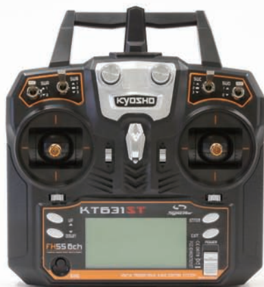
For aircraft, yachts, cars and DRONE RACER

Syncro KT631ST 2.4GHz Digital Proportional Radio Control System