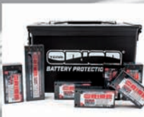
LIPO BATTERY PROTECTION BOX #ORI43040-10x31x17.5 #ORI43041-15.5x32x19 #ORI43042-18.5x34x23