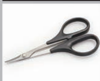
STAINLESS POLY-CARBONATE BODY SCISSORS - CURVED #36262