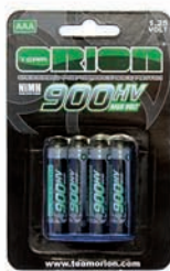
900 HV NiMH AAA #ORI13202