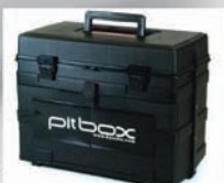
KYOSHO BLACK PIT BOX #80461 420x240x330