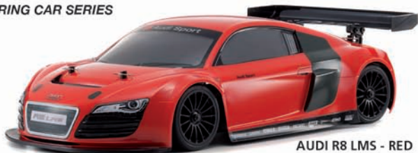
AUDI R8 LMS - RED #33205